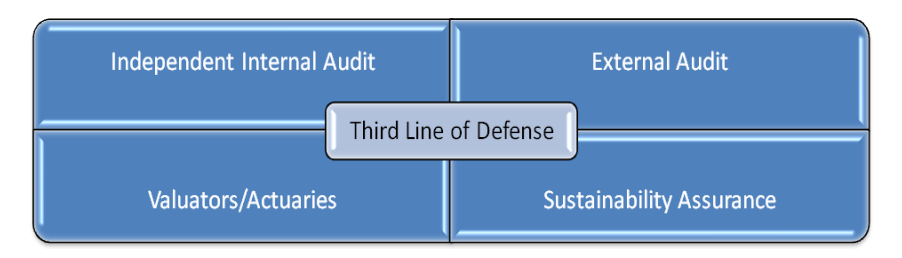
Fig. 5. Third Line of Defense

Reporting lines: Regulators, Board and Audit Committees, (objectivity is a key criteria), C Suite