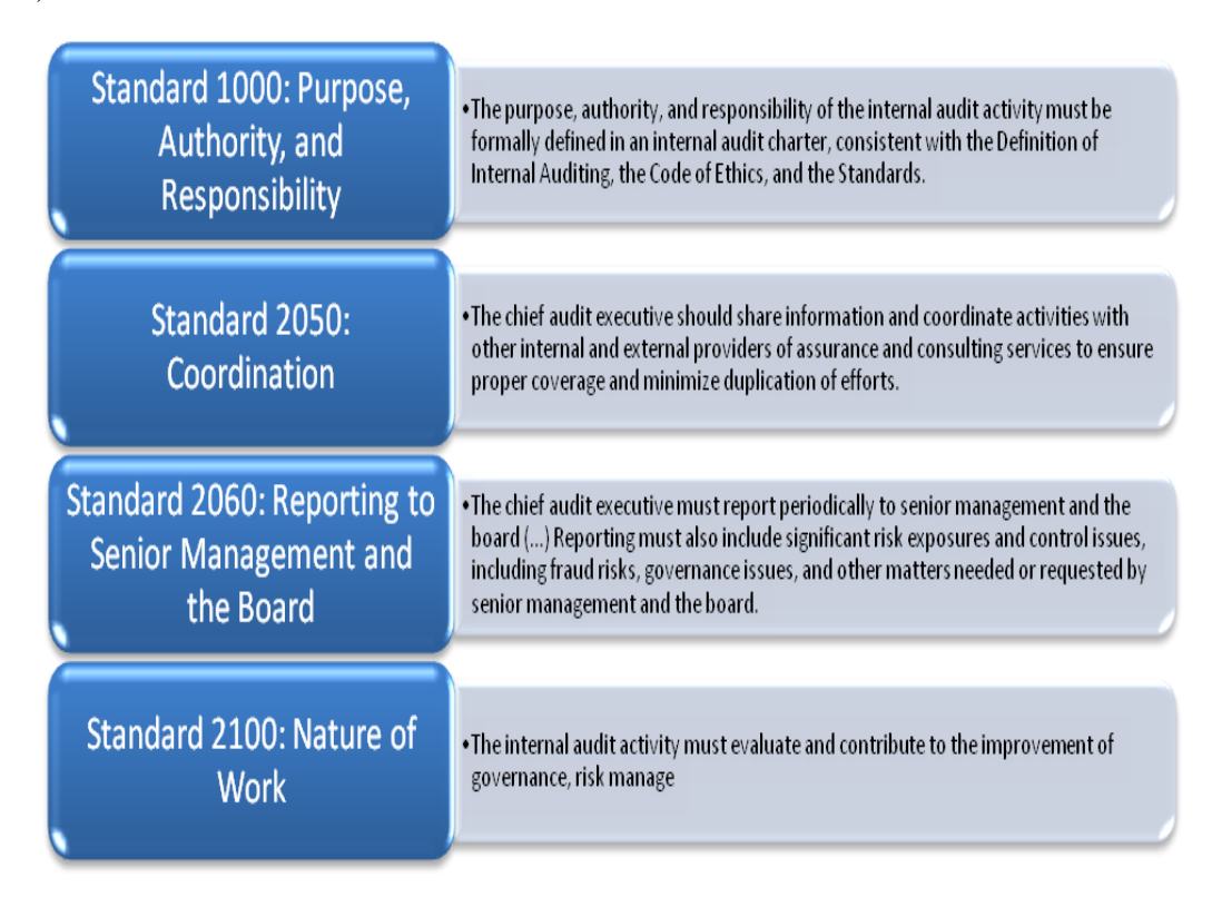
Fig. 2. IIA Standards (about Combined Assurance)

The Standards are included in The IIA's International Professional Practices Framework (IPPF), which provides internal audit professionals worldwide with authoritative mandatory and recommended guidance. Although there is no specific standard in the IPPF on how combined assurance should be provided, several standards are closely related (see figure 2).