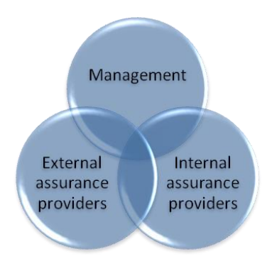
Fig. 1. Parties Involved in the Combined Assurance

Specific recommendations on how best to implement combined assurance are limited. However, there are several international standards of the IIS International Standards for the Professional Practice of Internal Auditing (Standards) indirectly related to the needs of