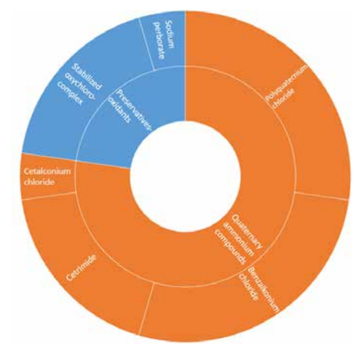
Fig. 2. The structure of oxidants and quaternary ammonium compounds used as preservatives of DES STMs

The most widespread way of ensuring the sterility after the opening of original packaging of DES STMs is adding preservatives to their composition. Among the additive agents of this group, which have been detected in the course of the analysis of the composition of DES STMs that are present on the pharmaceutical market of Ukraine, there are both organic and inorganic ones, which by the class of chemical compounds belong to the Quaternary ammonium compounds or oxidants (Fig. 2).